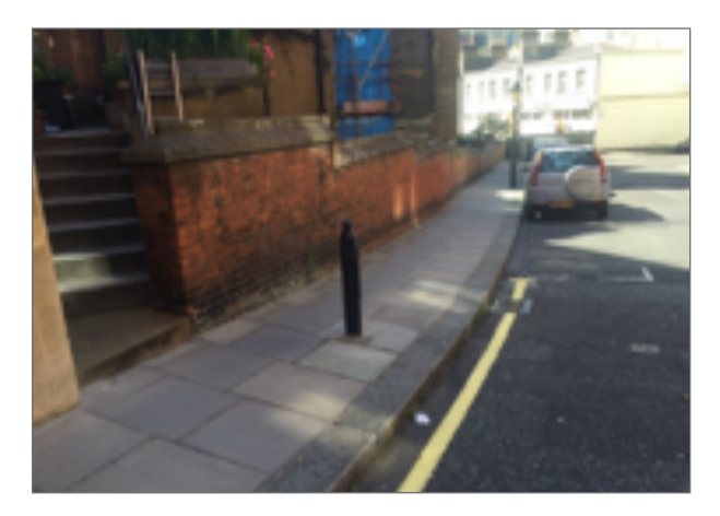
Old lamppost stump should be removed

2.5 The actions, along with the lead partners and proposed timescales are detailed in Appendix A. The Forum has also identified where these actions can contribute to the achievement of many of the 17 Sustainable Development Goals (SDGs) within the United Nations' 2030 Agenda for Sustainable Development<sup>1</sup>.