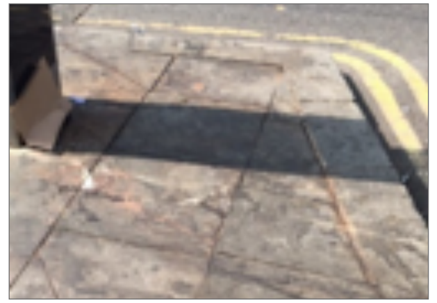
Examples of dirty pavement on corner of Brompton Road and Montpelier Street