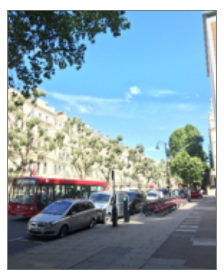
Potential to double cycle hire space near Imperial College London