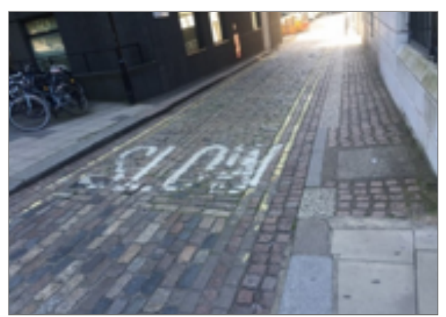
Road painting on cobbles should be consistent