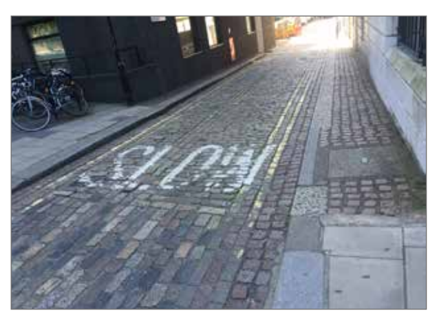
Road painting on cobbles should be consistent