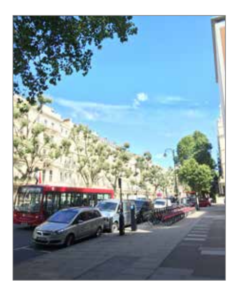
Potential to double cycle hire space near Imperial College London