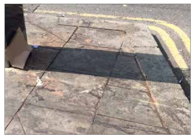
Examples of dirty pavement on corner of Brompton Road and Montpelier Street