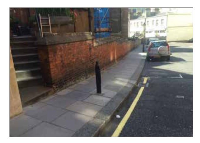
Old street light stump should be removed

2.5 The actions, along with the lead partners and proposed timescales are detailed in Appendix A. The Forum has also identified where these actions can contribute to the achievement of many of the 17 Sustainable Development Goals (SDGs) within the United Nations 2030 Agenda for Sustainable Development<sup>1</sup>.