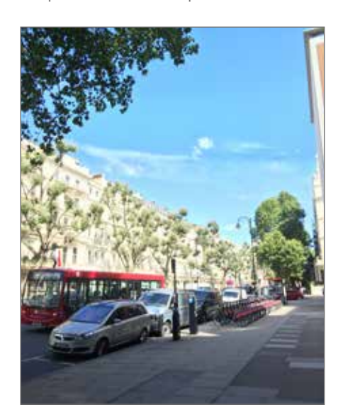
Potential to double cycle hire space near Imperial College London