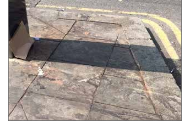
Examples of dirty pavement on corner of Brompton Road and Montpelier Street