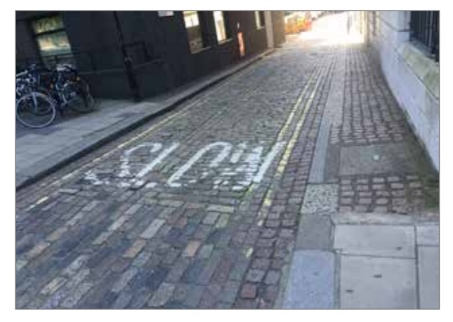
Road painting on cobbles should be consistent