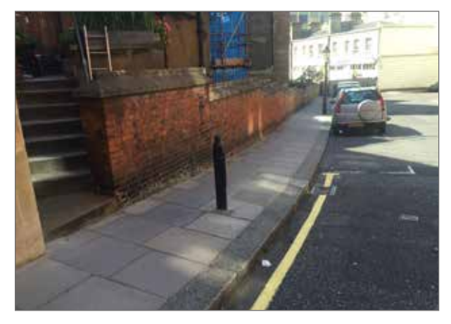
Old street light stump should be removed

2.5 The actions, along with the lead partners and proposed timescales are detailed in Appendix A. The Forum has also identified where these actions can contribute to the achievement of many of the 17 Sustainable Development Goals (SDGs) within the United Nations 2030 Agenda for Sustainable Development<sup>1</sup>.