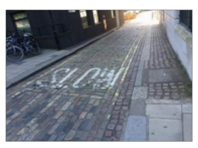
Road painting on cobbles should be consistent