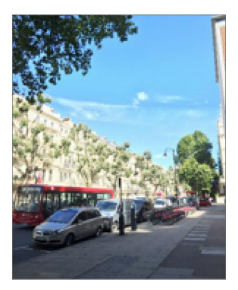
Potential to double cycle hire space near Imperial College London