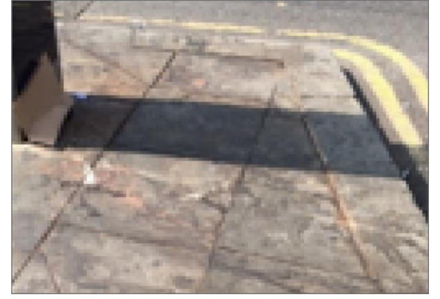
Examples of dirty pavement on corner of Brompton Road and Montpelier Street