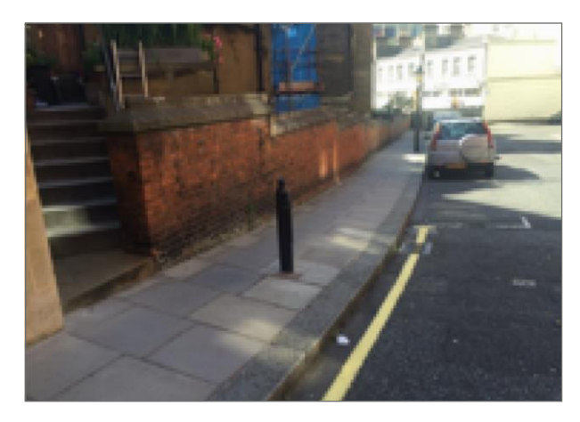
Old street lightlamppost stump should be removed

the achievement of many of the 17 Sustainable Development Goals (SDGs) within the United Nations' 2030 Agenda for Sustainable Development<sup>1</sup>.